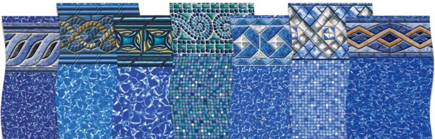
Beaded or UniBead Emerald Tile